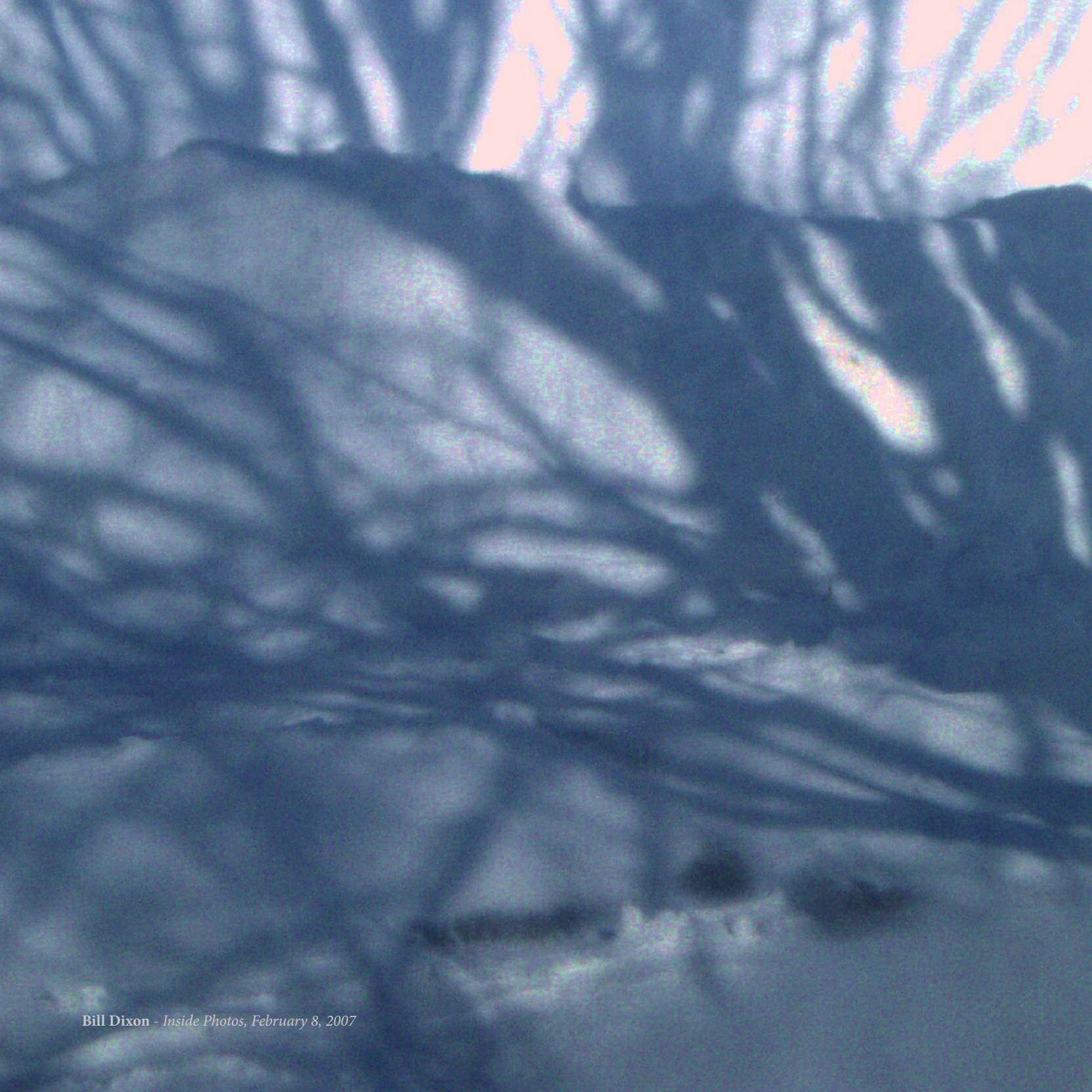
Bill Dixon - Inside Photos , February 8, 2007